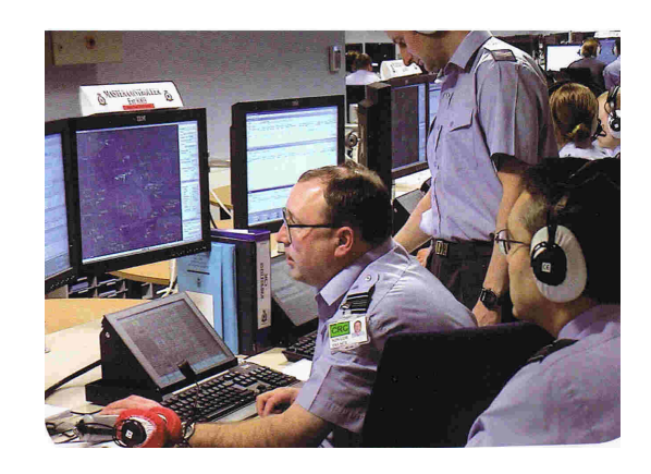
THE CRC CONTROLLERS PROVIDES 24/7 COVERAGE OF UK AIRSPACE

During the cold war, the whole operation was housed and controlled deep underground in hardened bunkers. Now - although security is tight - the controllers can relax offwatch in an airport style lounge. Air surveillance duties are shared with a second CRC at RAF Boulmer and between them they provide a 24/7 capability.