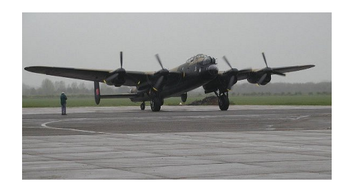
THE EAST KIRKBY LANCASTER ONCE THE GATE GUARDIAN AT RAF SCAMPTON

With luck, there may be life in the old place yet!